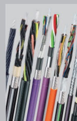
Cables in motion

TSUBAKIMOTO EUROPE B.V. AVENTURIJN 1200 3316 LB DORDRECHT THE NETHERLANDS TEL: +31 (0)78 620 4000 FAX: +31 (0)78 620 4001 E-MAIL: INFO@TSUBAKI.EU INTERNET: HTTP://TSUBAKI.EU