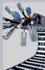
TOTALTRAX complete systems