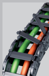
Plastic cable carrier systems