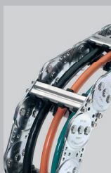
Steel cable carrier systems

For more information, please visit: kabelschlepp.de